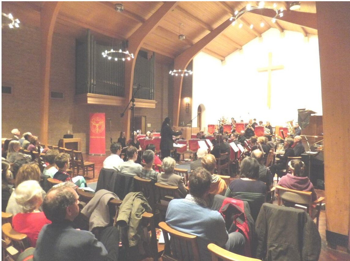
Concert 22 March 2015 - Amersham Free Church