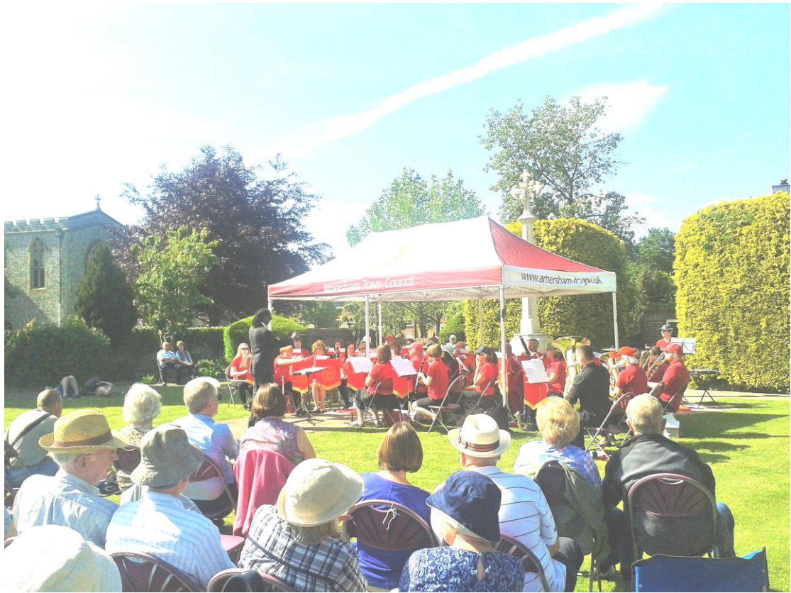
Amersham Memorial Garden - June 2015